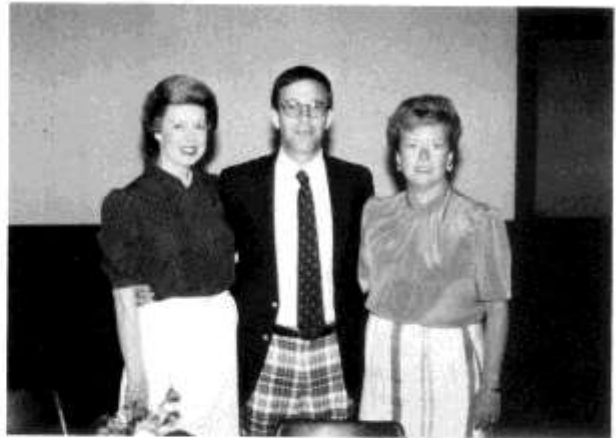
"Hurry Up! I need a City!"