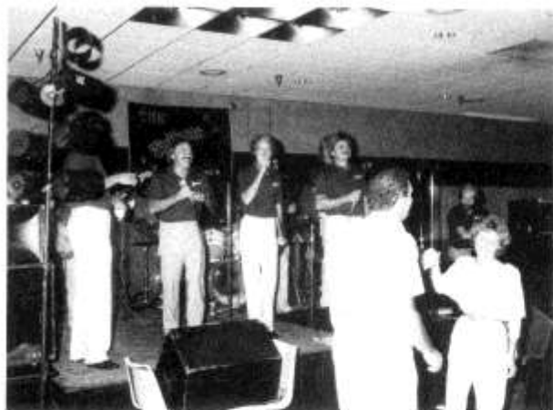
The Sultans are still the greatest!