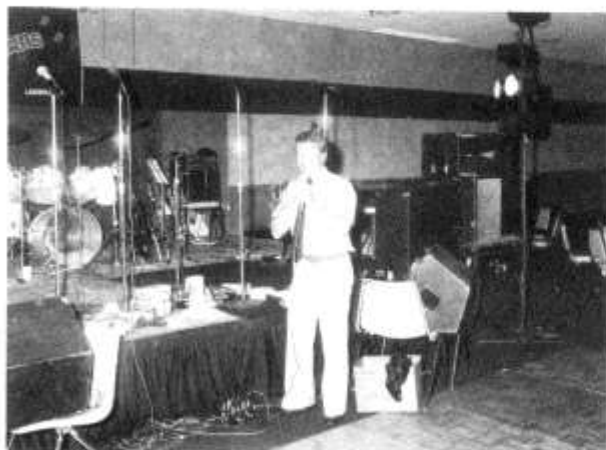
Roll the credits!!!