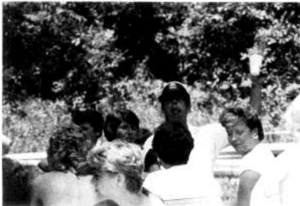
This Bud's for you!!!