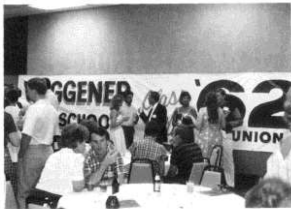
A Toast to the class of '62.