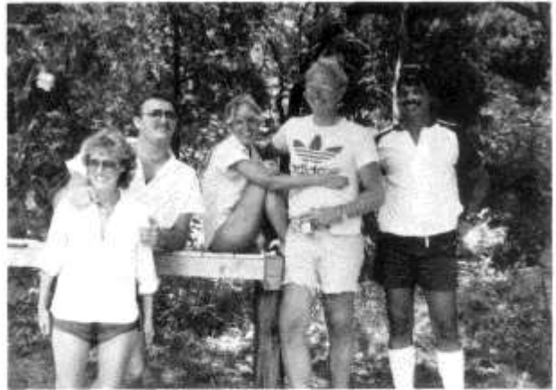
How do they stay so fit???