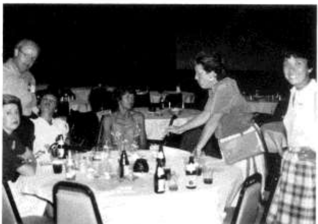
"Is it really 3 A.M.?"