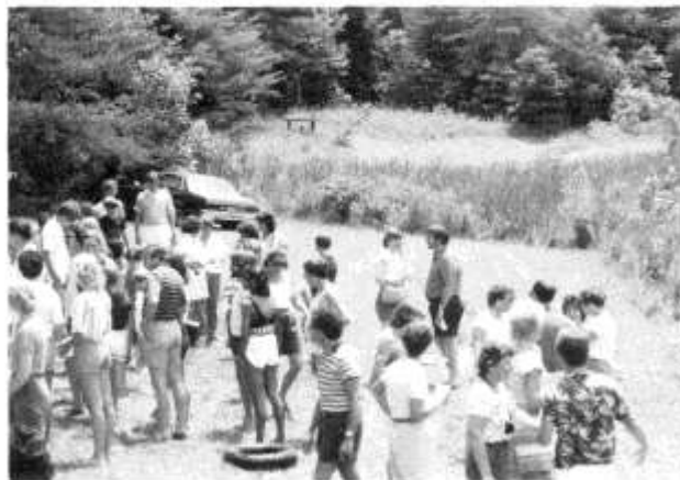
It's PIG-OUT time!!!!