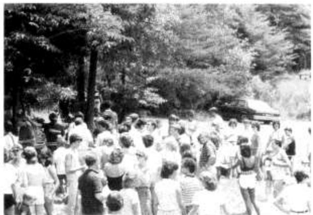
A rather prolific group, aren't we?