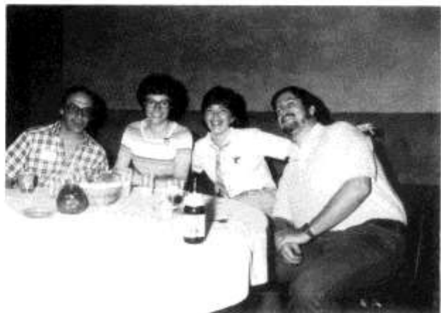
Tonight's the night.....