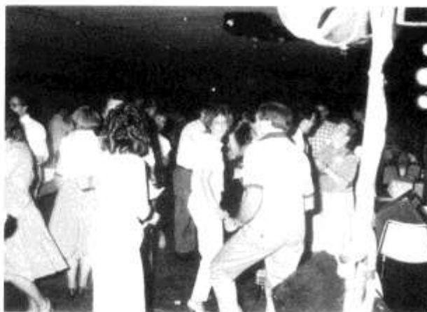
Twist and Shout