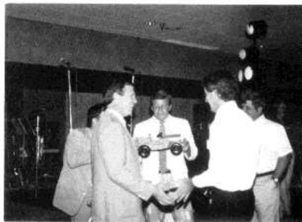
The truth comes out.....