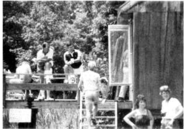
"Is it my turn"????