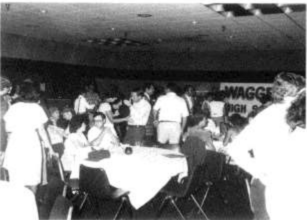
"Where's the band"????