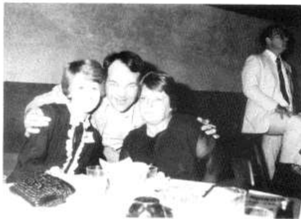
"Alright, girls, down to the station."