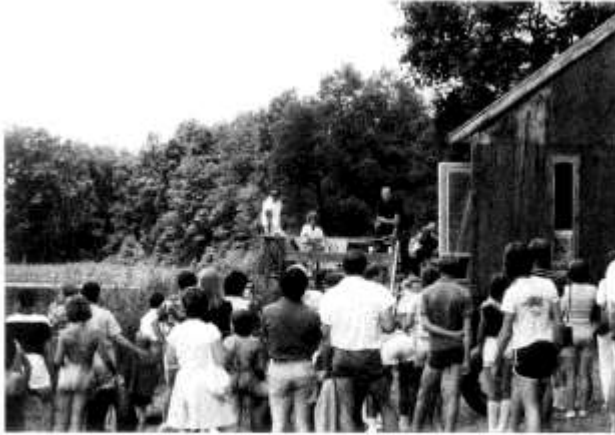
Giving thanks for the memories.