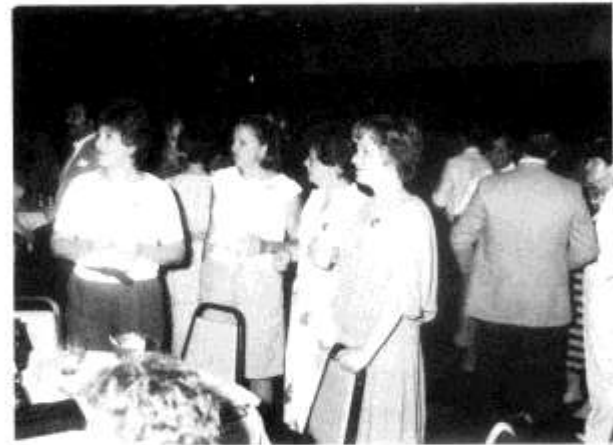
"Who mixed these drinks"?