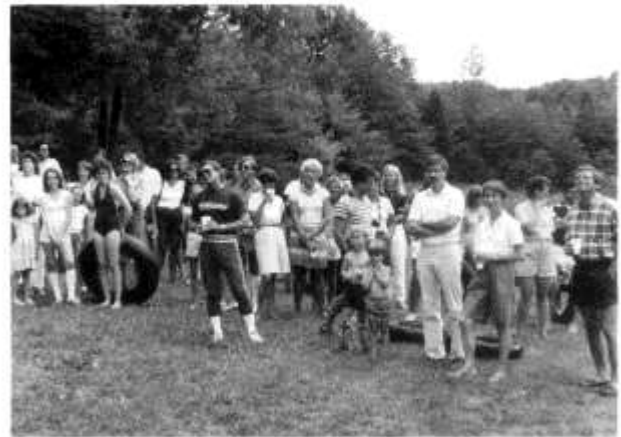
Looking forward to the 30th reunion.