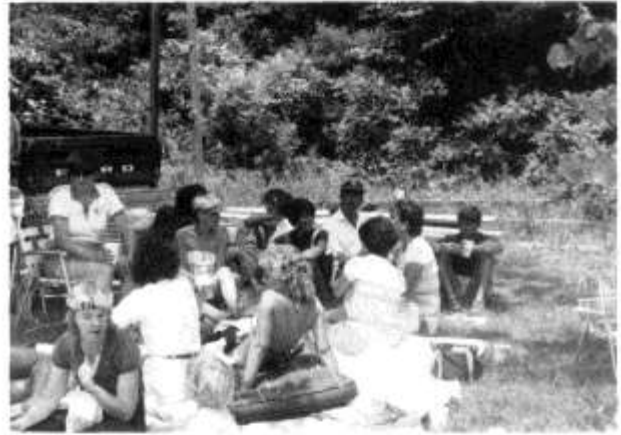
Shades of Hogan's Fountain.