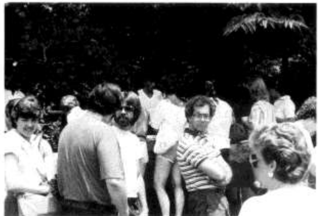
"You put a cherry bomb where?"