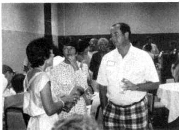
"I don't believe that story"!