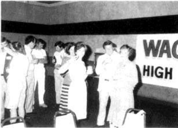
"Just a short one"!