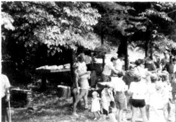
"Who invited all these tacky people?"