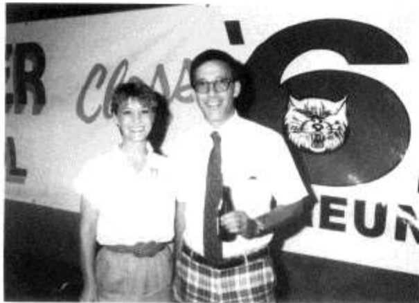
Now it's the committee's turn to have fun.