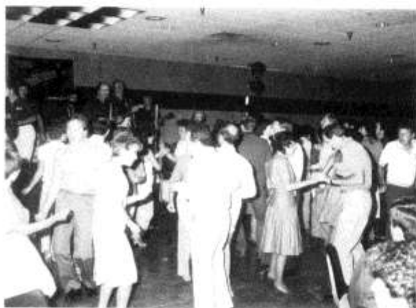
Memories of Zachary Taylor