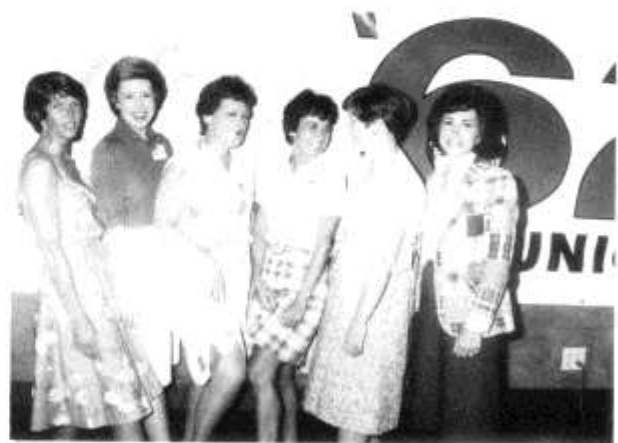
Cheese cake gone sour