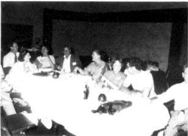
"I saw that on the restroom wall".