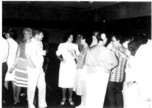
"Let's meet at The Big Boy after the dance".