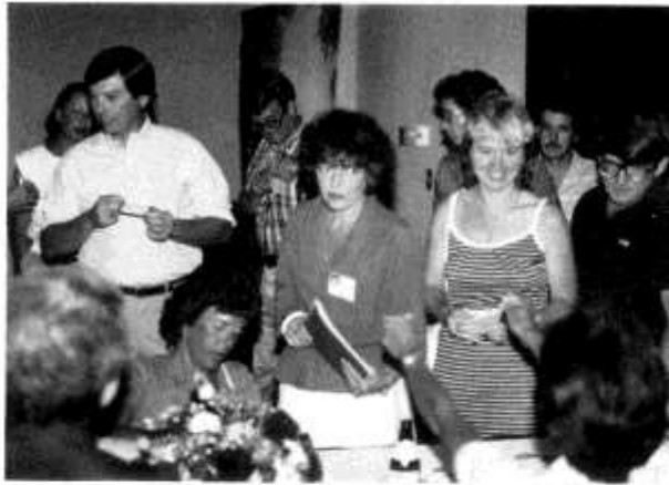
"I do look better than I did twenty-two years ago".